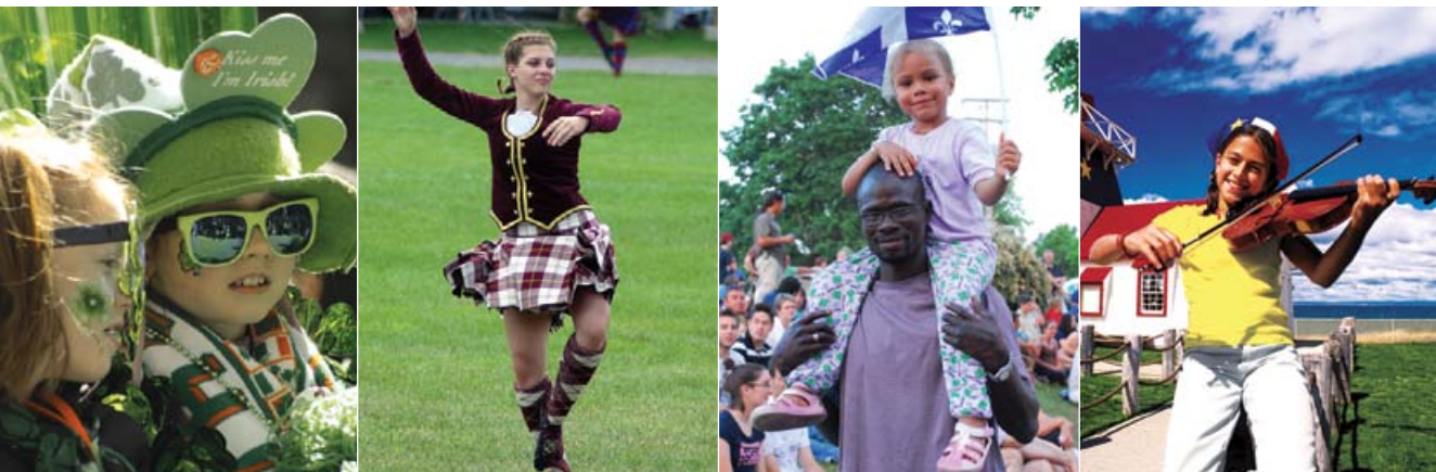
(From Left to Right) St. Patrick's Day Parade, Montreal, Quebec Highland dancer at Glengarry Highland Games, Maxville, Ontario Celebrating Fête Nationale, Gatineau, Quebec Acadian fiddler, Village of Grande-Anse, New Brunswick

About 65% of the Aboriginal people are First Nations, while 30% are Métis and 4% Inuit.