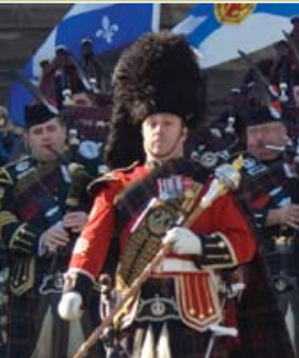
Pipes and drums in Ottawa

Young Polish dancers in Oliver, British Columbia