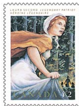
In 1813, Laura Secord, pioneer wife and mother of five children, made a dangerous 19-mile (30-km) journey on foot to warn Lieutenant James FitzGibbon of a planned American attack. Her bravery contributed to victory at the Battle of Beaver Dams. She is recognized as a heroine to this day