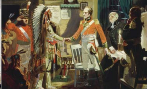
(From Left to Right) HMS Shannon , a Royal Navy frigate, leads the captured USS Chesapeake into Halifax harbour, 1813. There were also naval battles on the Great Lakes