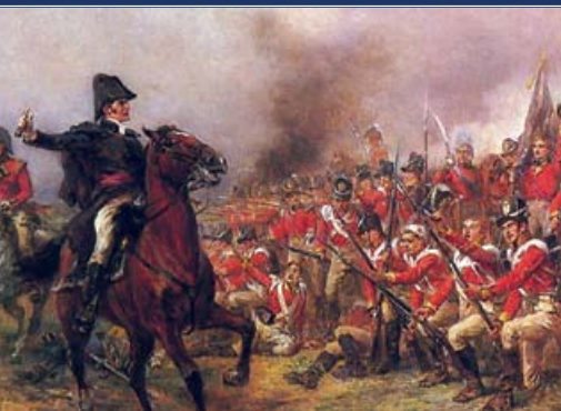
The Duke of Wellington sent some of his best soldiers to defend Canada in 1814. He then chose Bytown (Ottawa) as the endpoint of the Rideau Canal, part of a network of forts to prevent the U.S.A. from invading Canada again. Wellington, who defeated Napoleon in 1815, therefore played a direct role in founding the national capital

By 1814, the American attempt to conquer Canada had failed. The British paid for a costly Canadian defence system, including the Citadels at Halifax and Québec City, the naval drydock at Halifax and Fort Henry at Kingston—today popular historic sites. The present-day Canada-U.S.A. border is partly an outcome of the War of 1812, which ensured that Canada would remain independent of the United States.