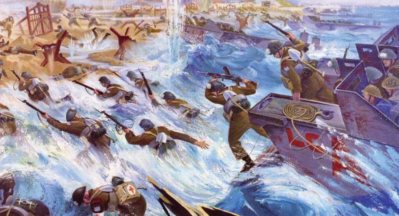
In the Second World War, the Canadians captured Juno Beach as part of the Allied invasion of Normandy on D-Day, June 6, 1944