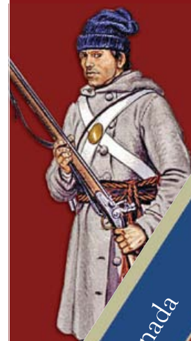
French-Canadian militiamen helped defend Canada in the War of 1812